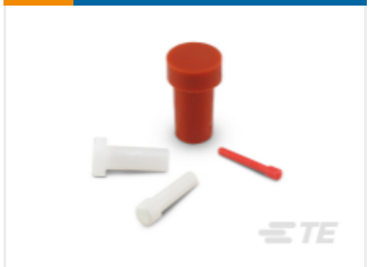
TE Part # CAT-D48-SP729 DEUTSCH Sealing Plugs