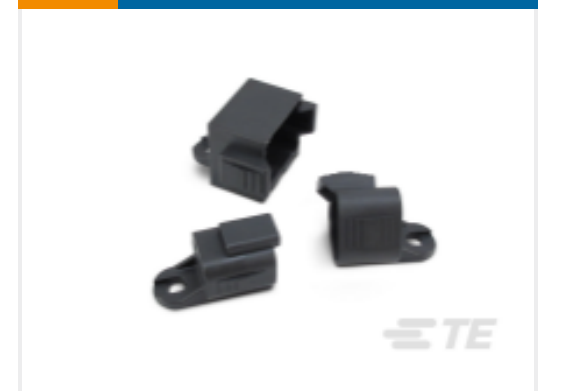
TE Part # CAT-D487-P729 Dust Caps — DEUTSCH DT