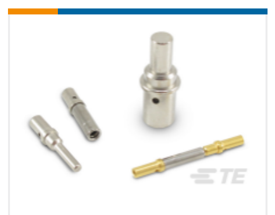
TE Part # CAT-D48-ST273 DEUTSCH Solid Contacts