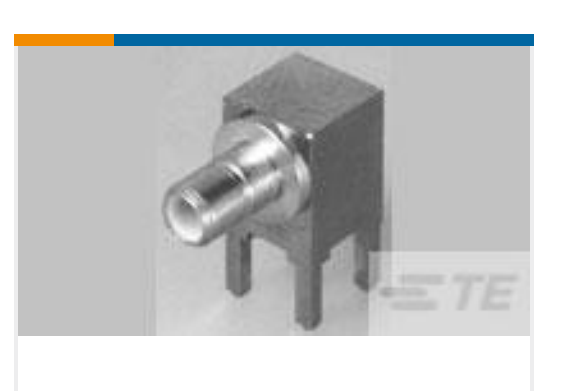
TE Part #414026-2 JACK ASSY,SMB,RT ANG