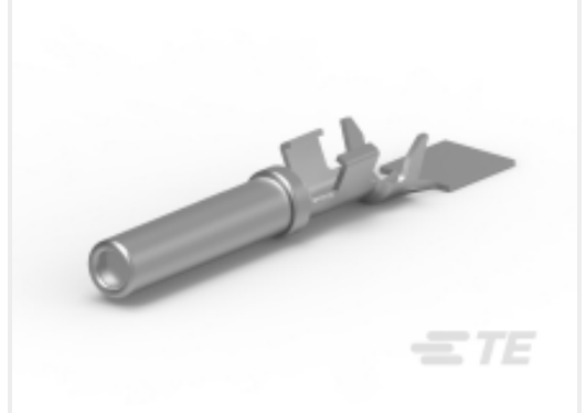
TE Part # CAT-J67-DSCC16 DEUTSCH Size 16 Crimp Contacts