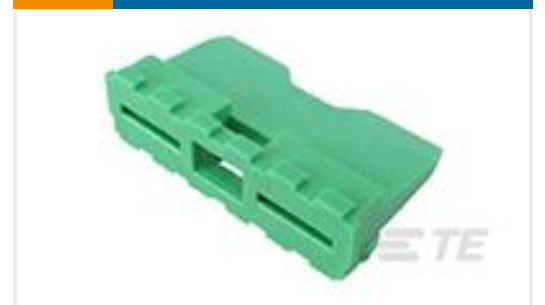
TE Part # W12P WEDGE LOCK, 12P, REC, GRN, DT