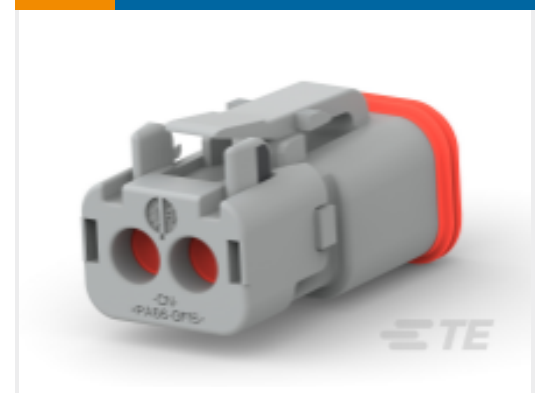
TE Part # CAT-J41-DDPC DEUTSCH DT Plug Connectors