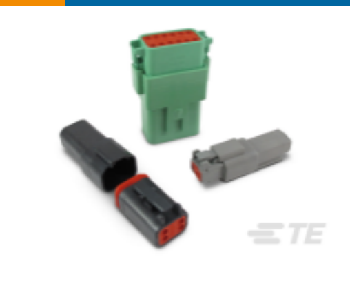
TE Part # CAT-D487-CH8172 DEUTSCH DT Series Housings & Connectors

TE Part # CAT-D48-SFT273 DEUTSCH Stamped and Formed Contacts