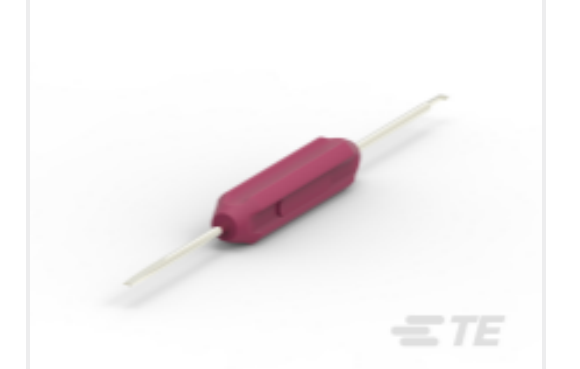
TE Part # DT-RT1 EXT TOOL, FRONT RELEASE