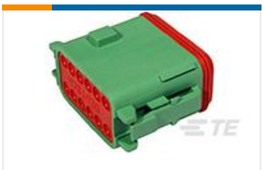
TE Part #DT06-12SC-P012 PLG, 12P, GRN, N, SEAL RET, ENH KEY, C