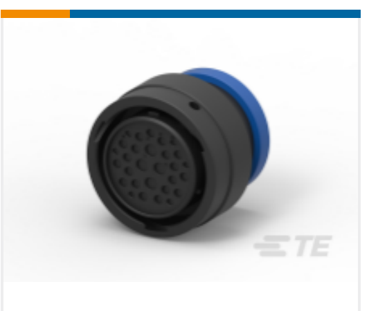
TE Part #HDP26-24-29SE-L017 PLG, 29P, BLK, E, RNG, 12/16/20, S