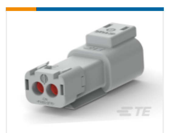
TE Part #DT04-12PB-C015 DEUTSCH DT Receptacle Connectors