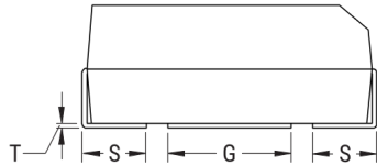
ANODE (+) END VIEW