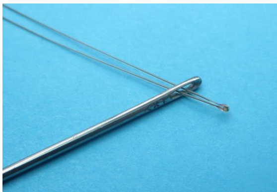
Figure 1 The physical photo of ATH10K1R0