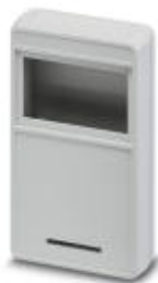
Handheld housing, C-Mini-Plus, light gray, consisting of two half shells, two front plates with screws, front 1.1 mm recessed, with window and keypad slot

Please be informed that the data shown in this PDF Document is generated from our Online Catalog. Please find the complete data in the user's documentation. Our General Terms of Use for Downloads are valid ( http://phoenixcontact.com/download )