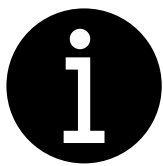
General Product Information