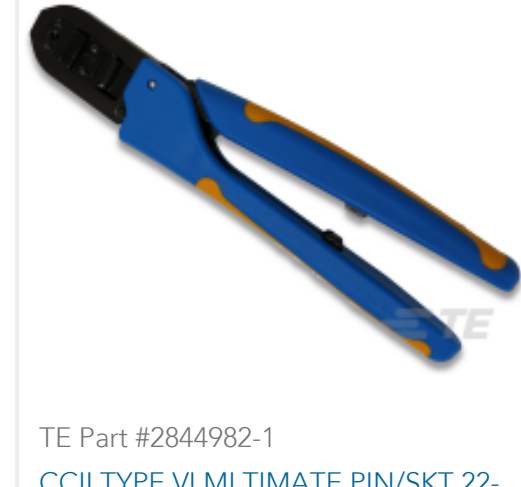
CCII TYPE VI MLTIMATE PIN/SKT 22-18 ASSY