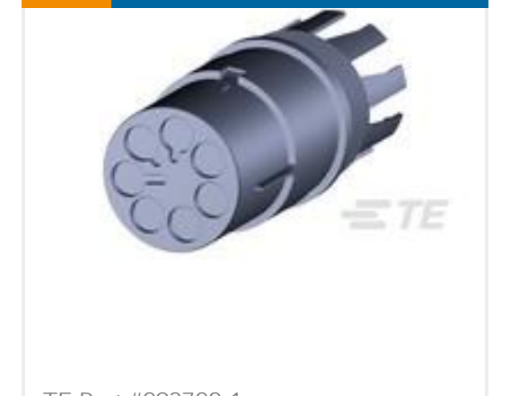
TE Part #293722-1 NECTOR M PIN HSG FREE HANGING 7P CODE A