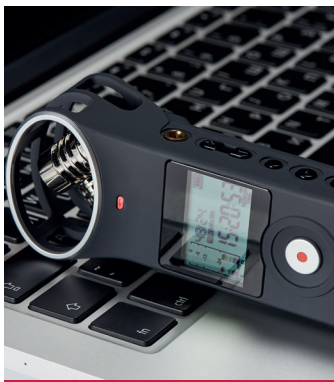
Portable Audio Hardware