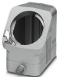
HEAVYCON EVO sleeve housing, EMC version, without powder coating, with bayonet flange for EVO screw connection, B10, for single locking latch, height: 64 mm, without EVO screw connection.

Please be informed that the data shown in this PDF Document is generated from our Online Catalog. Please find the complete data in the user's documentation. Our General Terms of Use for Downloads are valid ( http://phoenixcontact.com/download )