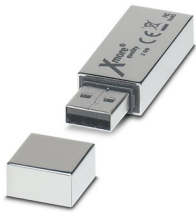
USB memory stick, 8 GB

https://www.phoenixcontact.com/us/products/2402809