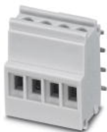
PCB terminal block, pitch: 3.5 mm, number of positions: 4, color: light gray. Article with lateral pin exit

Please be informed that the data shown in this PDF Document is generated from our Online Catalog. Please find the complete data in the user's documentation. Our General Terms of Use for Downloads are valid ( http://phoenixcontact.com/download )