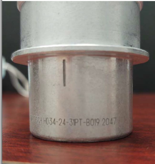
Old Format Focus