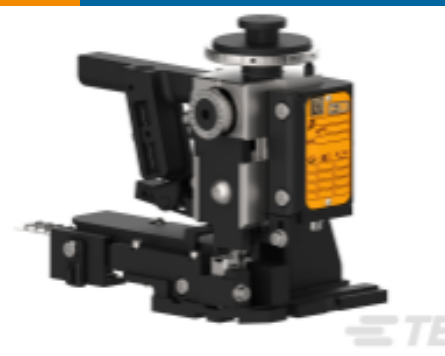
TE Part #2836167-1 OCEAN_2.0_Applicator-S-045F