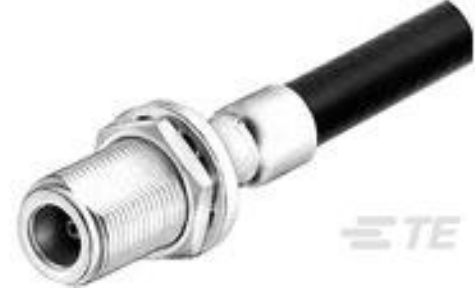
TE Part #225094-1 N SER BHD JACK WEATHERPROOF