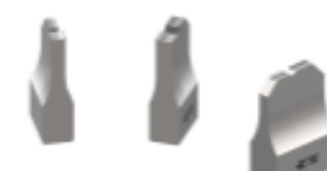
ANVIL REPRESENTATION ONLY