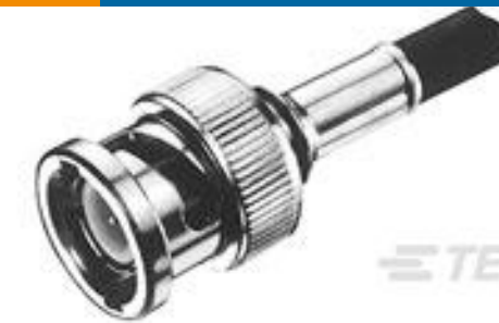
TE Part #227079-9 COMM. BNC-PLUG