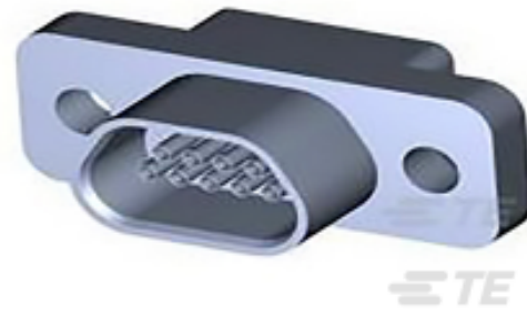
TE Part #1532177-1 M83513/04-G01N, MCKS-N1-B- 5156G1-18.0