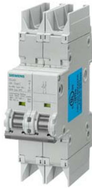
Circuit breaker 10kA, 2-pole, D, 3 A according to UL 489-480Y/277V