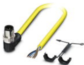
Sensor/actuator cable, 5-position, PVC, yellow, Plug angled M12 SPEEDCON, A-coded, on free cable end, cable length: 10 m

Please be informed that the data shown in this PDF Document is generated from our Online Catalog. Please find the complete data in the user's documentation. Our General Terms of Use for Downloads are valid ( http://phoenixcontact.com/download )