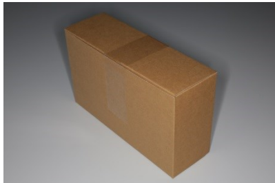
New cardboard box with compartments