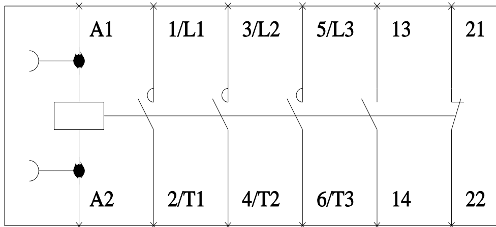
LENO0C003 Wiring Diagram