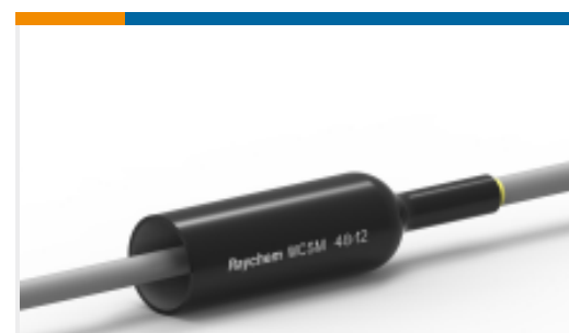
TE Part #EE0471-000 WCSM-48/12-1200-S(B10)