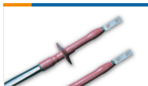
TE Part #E32972-000 HVT-Z-80-G/SG