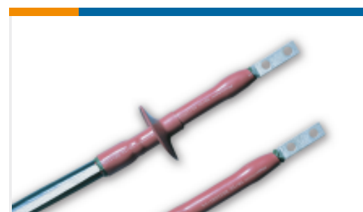
TE Part #CB2511-000 HVT-Z-152-SJ