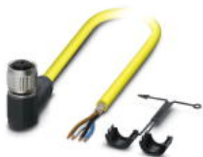
Sensor/actuator cable, 4-position, PVC, yellow, shielded, free cable end, on Socket angled M12 SPEEDCON, A-coded, cable length: 2 m

Please be informed that the data shown in this PDF Document is generated from our Online Catalog. Please find the complete data in the user's documentation. Our General Terms of Use for Downloads are valid ( http://phoenixcontact.com/download )