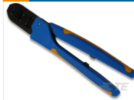
TE Part #2844982-1 CCII TYPE VI MLTIMATE PIN/SKT 22- 18 ASSY