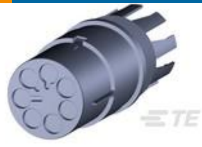
TE Part #293722-1 NECTOR M PIN HSG FREE HANGING 7P CODE A