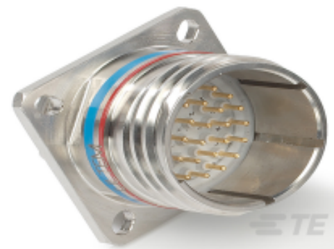
TE Part #YDTS20F21-16AC0000 SQUARE FLANGE RECEPTACLE