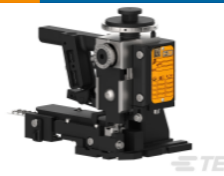
TE Part #2836167-1 OCEAN_2.0_Applicator-S-045F