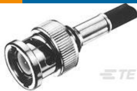
TE Part #227079-9 COMM. BNC-PLUG