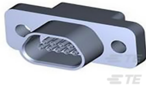
TE Part #1532177-1 M83513/04-G01N, MCKS-N1-B- 5156G1-18.0