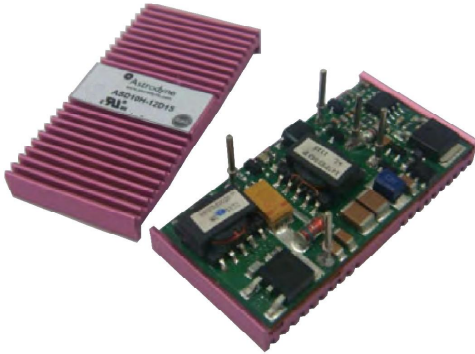
Unit measures 1"W x 2"L x 0.41"H