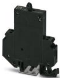
Thermomagnetic circuit breaker, 1-pos., normal blow, 1 N/C contact, with universal foot for mounting on NS 32 or NS 35

Please be informed that the data shown in this PDF Document is generated from our Online Catalog. Please find the complete data in the user's documentation. Our General Terms of Use for Downloads are valid ( http://phoenixcontact.com/download )