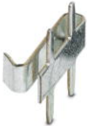
Component housing, PCB stop

Please be informed that the data shown in this PDF Document is generated from our Online Catalog. Please find the complete data in the user's documentation. Our General Terms of Use for Downloads are valid ( http://phoenixcontact.com/download )