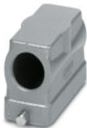
HEAVYCON B16 sleeve housing, for single locking latch, height: 65 mm, with 1 x M25 thread, lateral cable outlet

Please be informed that the data shown in this PDF Document is generated from our Online Catalog. Please find the complete data in the user's documentation. Our General Terms of Use for Downloads are valid ( http://phoenixcontact.com/download )