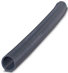
Protective hose, for protective house screw connection, packing volume: 25 m, M40

Please be informed that the data shown in this PDF Document is generated from our Online Catalog. Please find the complete data in the user's documentation. Our General Terms of Use for Downloads are valid ( http://phoenixcontact.com/download )