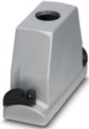
HEAVYCON ADVANCE EMV sleeve housing B24, with bayonet locking, height 100 mm, with 1x M32 thread, straight cable outlet

Please be informed that the data shown in this PDF Document is generated from our Online Catalog. Please find the complete data in the user's documentation. Our General Terms of Use for Downloads are valid ( http://download.phoenixcontact.com )