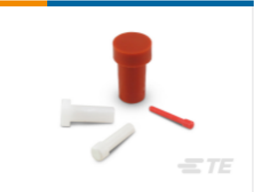
TE Part # CAT-D48-SP729 DEUTSCH Sealing Plugs