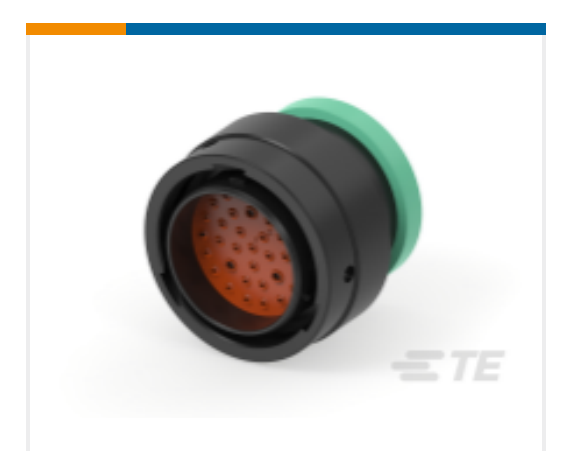
TE Part #HDP26-24-35PN-L017 PLG, 35P, BLK, N, RNG, 16/20, P