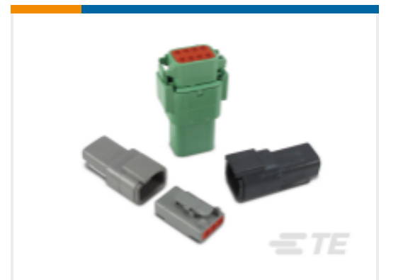
TE Part # CAT-D485-CH8172 DEUTSCH DTM Housings