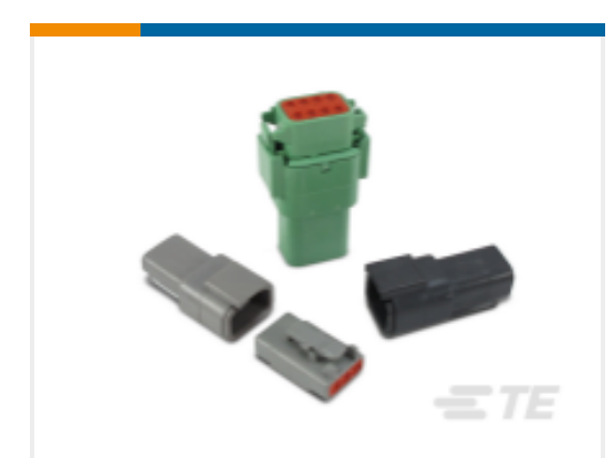
TE Part #DTM04-4P-E005 DEUTSCH DTM Housings