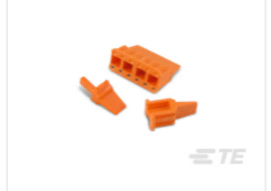
TE Part # CAT-D485-W416 DEUTSCH DTM Wedgelocks