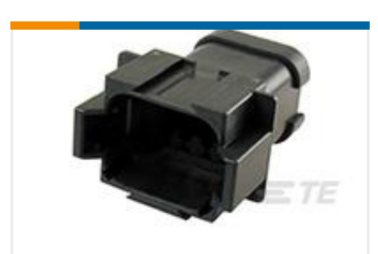
TE Part #DT04-08PA-E005 REC, 8P, BLK, N, CAP, A