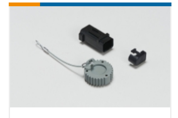
Automotive Connector Caps & Covers (107)