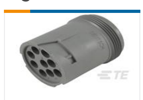
TE Part #HD14-9-96PE INL REC ASM