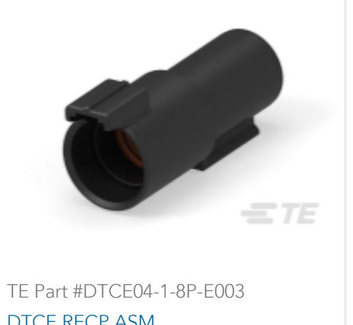
DTCE RECP ASM