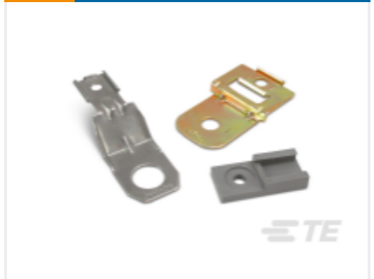
TE Part # CAT-D487-M8649 DEUTSCH DT Mounting Clips