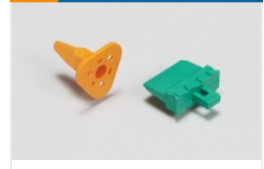
Automotive Connector Locks & Position Assurance(74)