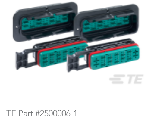
SRC Pwr 60+6AG Female Recp Hsg Assy 2.5