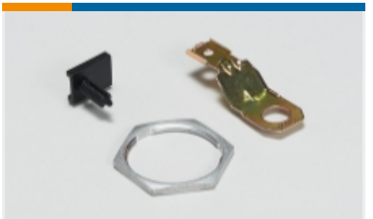
Other Automotive Connector Accessories(16)