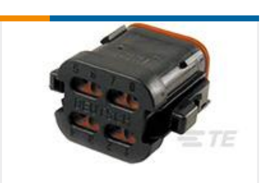
TE Part #DT06-08SA-EP08 PLG, 8P, BLK, N, SEAL RET, CAP, A