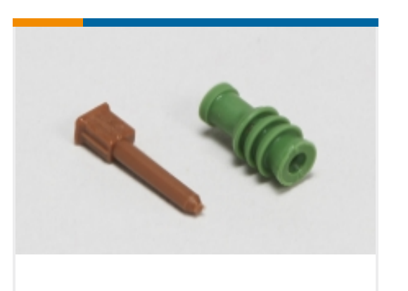
Automotive Seals & Cavity Plugs(5)