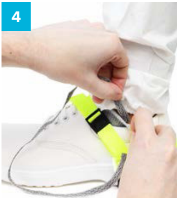
4 Feed the Grey Conductive Ribbon into the sock or shoe to complete the grounding path.