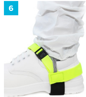
6 The footwear is now ready to be tested before entering a static sensitive area. Repeat with other shoe.

To request a quotation or for more information, please call +44 (0)1473 836200 email sales@antistat.com or visit www.antistat.com