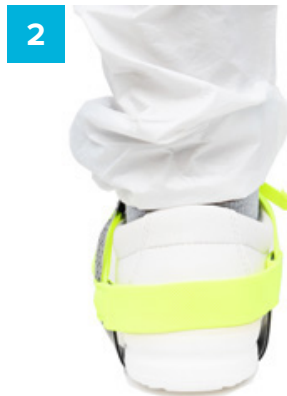
2 Place the Neon Elastic Strip at the back of the shoe.