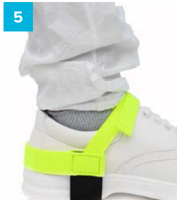
5 Inspect the Heel gripper for a secure and comfortable fit by gently tugging on the straps.