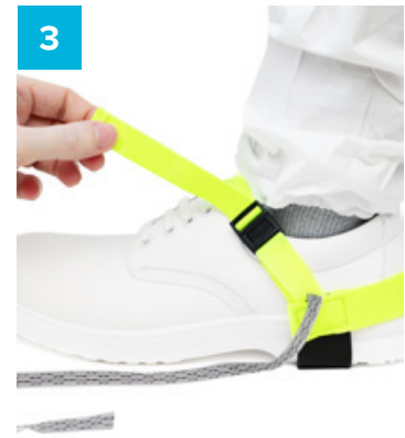
3 Push the Clip Fastener together to lock in place and pull the tail of the Neon Elastic Strap to tighten.