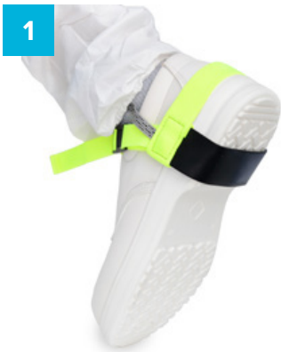
1 Remove Heel Gripper from its packaging and place the Black Conductive Rubber Strip on the heel grip of the shoe.