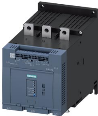
SIRIUS soft starter 200-600 V 250 A, 24 V AC/DC Spring-loaded terminals Thermistor input