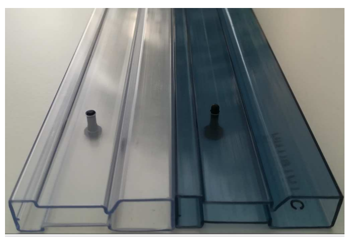
New transparent Tube