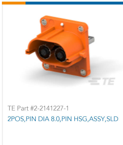
TE Part #2-2141227-1 2POS,PIN DIA 8.0,PIN HSG,ASSY,SLD