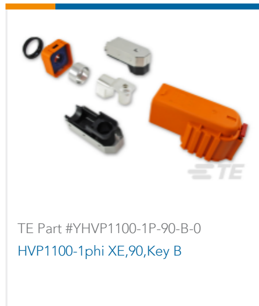
TE Part #YHVP1100-1P-90-B-0 HVP1100-1phi XE,90,Key B