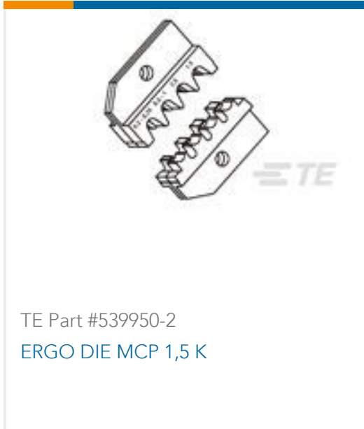
TE Part #539950-2 ERGO DIE MCP 1,5 K