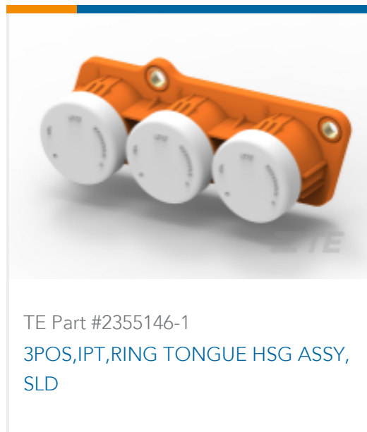
TE Part #2355146-1 3POS,IPT,RING TONGUE HSG ASSY, SLD