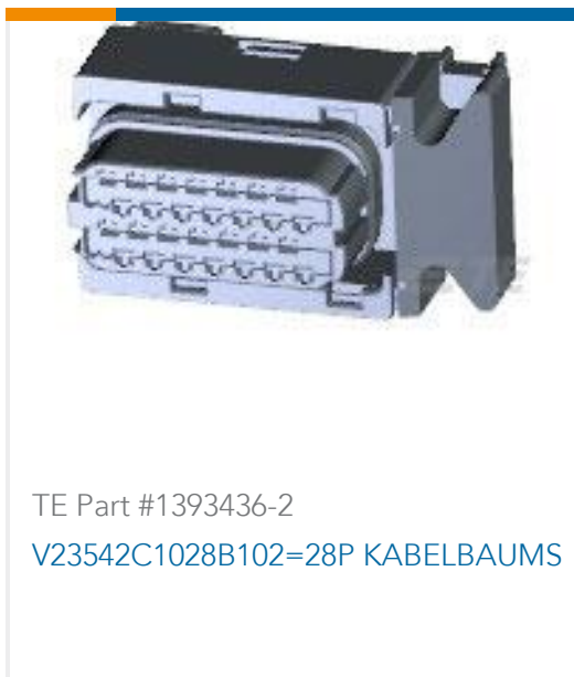
TE Part #1393436-2 V23542C1028B102=28P KABELBAUMS