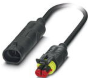
Sensor/actuator cable, 2-position, PUR halogen-free, black-gray RAL 7021, Plug straight Superseal Clip locking, on Socket straight Superseal Clip locking, cable length: 0.6 m

Please be informed that the data shown in this PDF Document is generated from our Online Catalog. Please find the complete data in the user's documentation. Our General Terms of Use for Downloads are valid ( http://phoenixcontact.com/download )