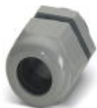
Cable gland, cable gland material: PA, external cable diameter 11 mm ... 17 mm, shielding: No, connecting thread: M25 x 1.5, color: silver-gray RAL 7001

Cable gland - G-INS-M25-M68N-PNES-GY - 1411126