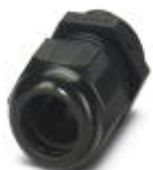
Cable gland, cable gland material: PA, external cable diameter 11 mm ... 17 mm, shielding: No, connecting thread: M25 x 1.5, color: jet black RAL 9005

Cable gland - G-INS-M25-M68N-PNES-BK - 1411134