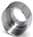
Step-up adapter, M25 to M32, including O-ring

Extension adapter - ENLAR-M-KV-M25/M32 - 1647679