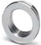
Step-down adapter, M25 to M20, including O-ring

Reducing adapter - REDUC-M-KV-M25/M20 - 1647624