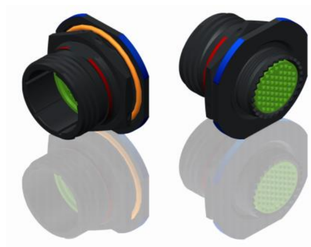
LAYOUT SHOWN AS EXAMPLE