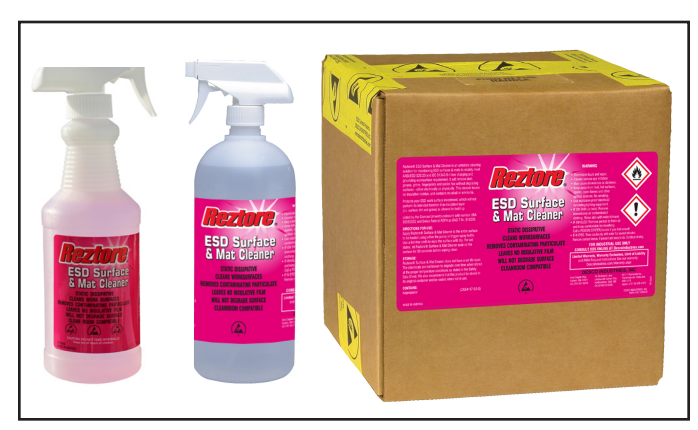
Figure 1. Reztore® Surface & Mat Cleaner: 16 Ounces (500 mL) Spray Bottle 1 Quart (1 liter) Spray Bottle 2.5 Gallons (10 liters) Bag-in-Box