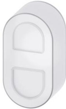
Silicone-free protective cover for Twin pushbutton, raised clear