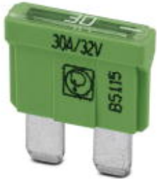
Flat-type plug-in fuse, type C, color code: light green, nominal current: 30 A

Please be informed that the data shown in this PDF Document is generated from our Online Catalog. Please find the complete data in the user's documentation. Our General Terms of Use for Downloads are valid ( http://phoenixcontact.com/download )