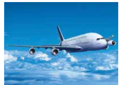
Accepted for use by major aircraft manufacturers.