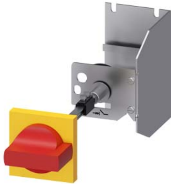
Door-coupling rotary operating mechanism for circuit breaker Size S00/S0 Handle emergency switching-off new design