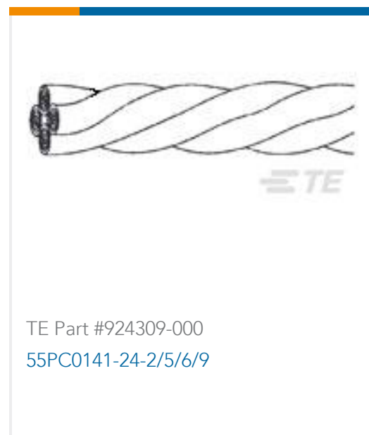
TE Part #924309-000 55PC0141-24-2/5/6/9