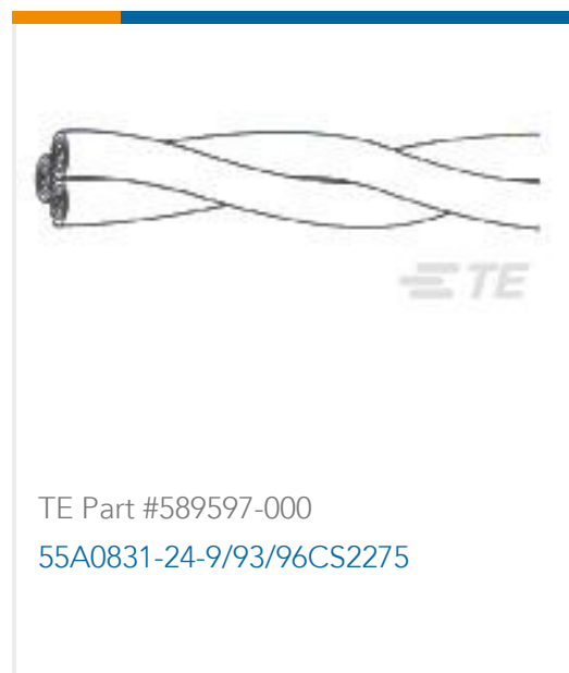
TE Part #589597-000 55A0831-24-9/93/96CS2275