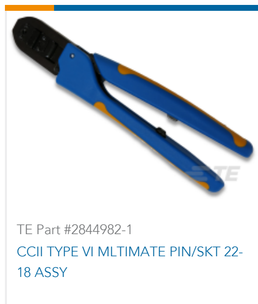
TE Part #2844982-1 CCII TYPE VI MLTIMATE PIN/SKT 22- 18 ASSY