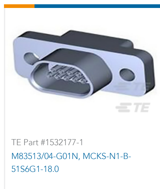
TE Part #1532177-1 M83513/04-G01N, MCKS-N1-B- 51S6G1-18.0