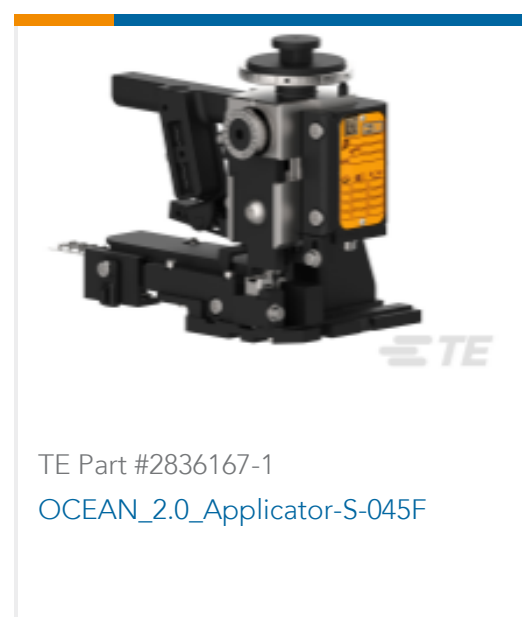
TE Part #2836167-1 OCEAN_2.0_Applicator-S-045F