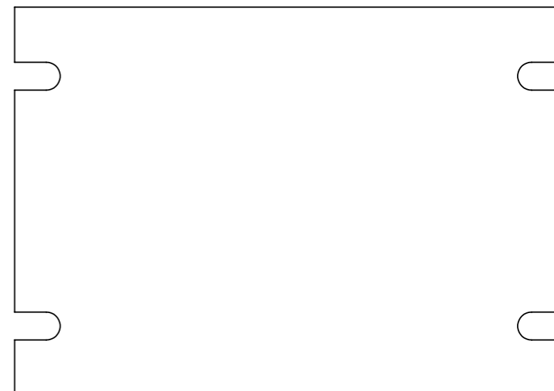
REFERENCE VIEW Scale: Full Size