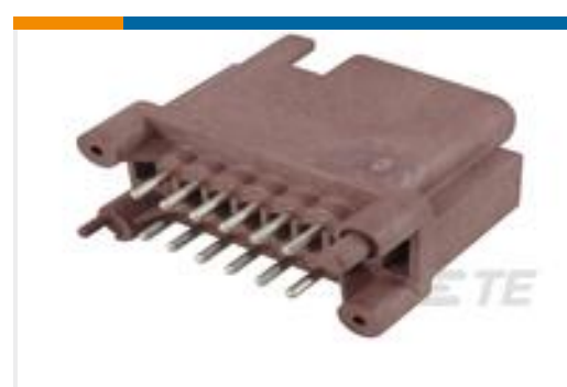
TE Part #DTF15-12PD HDR, 12P, BRN, ST, SN/NI/CU, D