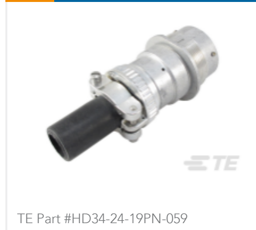
TE Part #HD34-24-19PN-059 REC,19P,AL,N,CBLCLMP BT,DRAIN,12 /16,P,MC

TE Part #1-1393304-8 V23134J2053X194-EV-CBOX