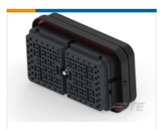
TE Part #DRB16-128SBE-L018 PLG, 128P, BLK, E, CAP, B