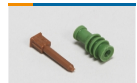
Automotive Seals & Cavity Plugs(1)