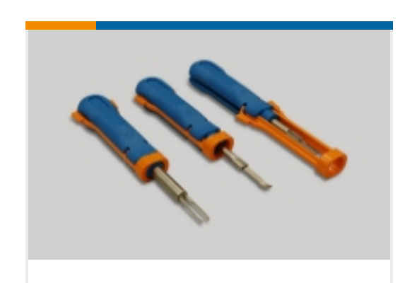
Insertion & Extraction Tools(11)