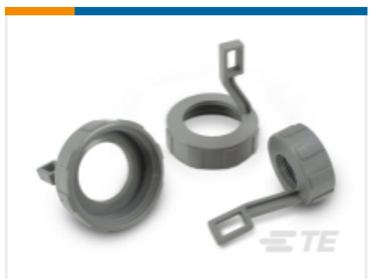
TE Part # CAT-H3910-B128 DEUTSCH HD10 Backshells