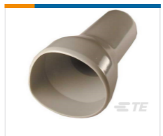
TE Part # HD30-24BT BOOT, 24SZ, ST, GRY