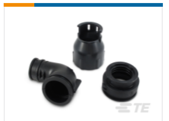
TE Part # CAT-H396-B128 DEUTSCH HDP20 Backshells