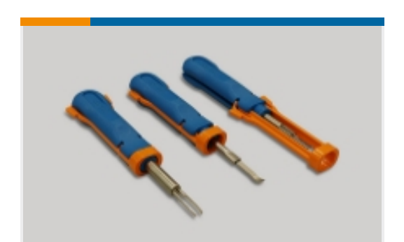
Insertion & Extraction Tools(11)