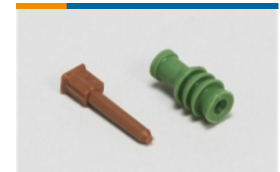
Automotive Seals & Cavity Plugs(10)