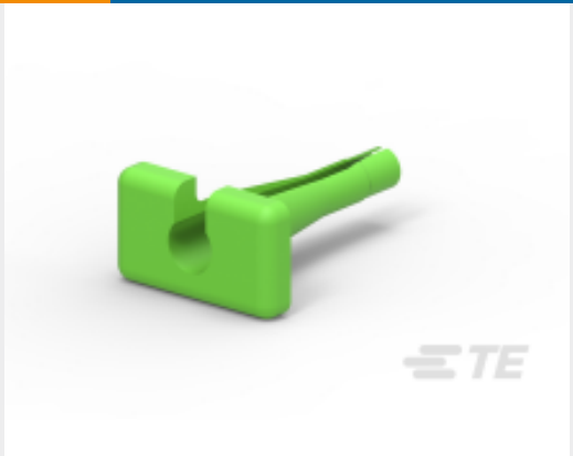
TE Part # 114008-ZZ EXT TOOL, SIZE 8, 8-10 AWG, N, GRN