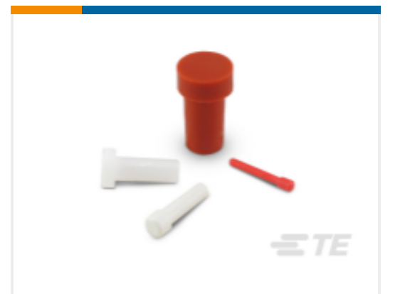
TE Part # CAT-D48-SP729 DEUTSCH Sealing Plugs