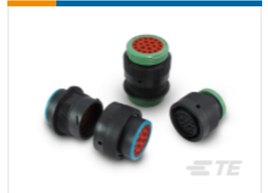
TE Part # CAT-H396-CH8172 DEUTSCH HDP20 Housings