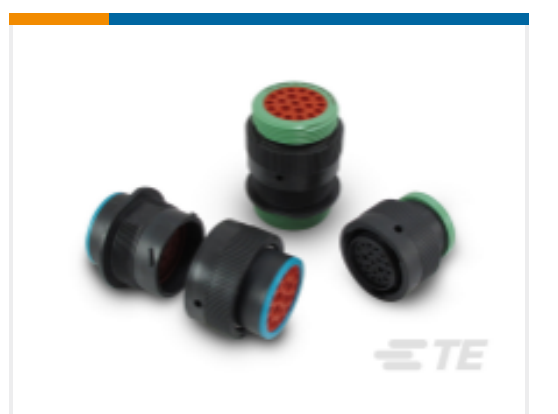
TE Part #HDP26-24-9SE-L015 DEUTSCH HDP20 Housings