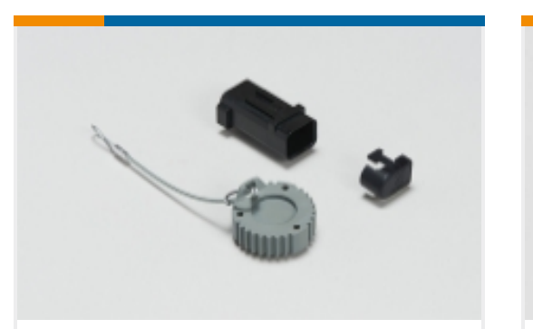
Automotive Connector Caps & Covers (65)