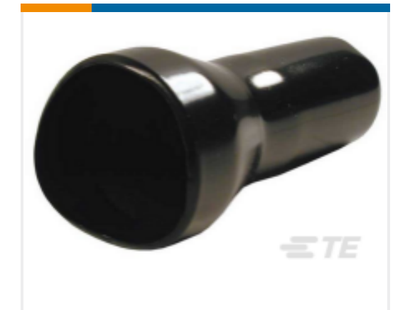
TE Part # HD30-24BT-BK BOOT, 24SZ, ST, BLK