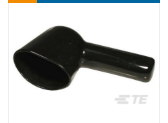
TE Part # HD30-24BT-90-BK BOOT, 24SZ, RA, BLK