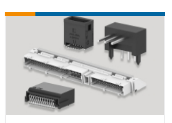
PCB Headers & Receptacles(1)