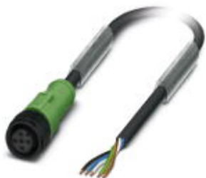
Sensor/actuator cable, 5-position, PUR halogen-free, black-gray RAL 7021, free cable end, on Socket straight M12, A-coded, cable length: 1.5 m, with plastic knurl

Please be informed that the data shown in this PDF Document is generated from our Online Catalog. Please find the complete data in the user's documentation. Our General Terms of Use for Downloads are valid ( http://phoenixcontact.com/download )