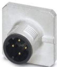
Sensor/actuator flush-type plug, 4-pos. socket, M12, D-coded, front/square flange mounting, wave soldering

Please be informed that the data shown in this PDF Document is generated from our Online Catalog. Please find the complete data in the user's documentation. Our General Terms of Use for Downloads are valid ( http://phoenixcontact.com/download )