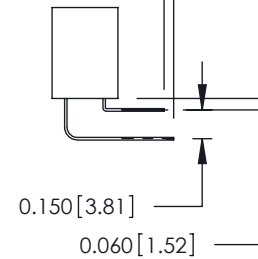
559 Contact Code

0.240 [6.10] Up to 27/54 Pin 0.162 [4.11] 28/56 and Over 0.290 [7.37] Up to 27/54 Pin .212 [5.38] 28/56 and Over