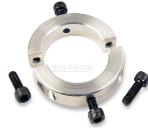
*Additional hardware NOT included