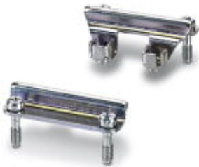
Adapter insert, type: D15

Please be informed that the data shown in this PDF Document is generated from our Online Catalog. Please find the complete data in the user's documentation. Our General Terms of Use for Downloads are valid ( http://phoenixcontact.com/download )