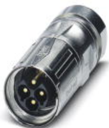
Cable connector, straight, SPEEDCON locking, M17, number of positions: 5+3+PE, type of contact: Pin, Crimp connection, shielded: yes, cable diameter range: 5 mm ... 8 mm

Please be informed that the data shown in this PDF Document is generated from our Online Catalog. Please find the complete data in the user's documentation. Our General Terms of Use for Downloads are valid ( http://phoenixcontact.com/download )