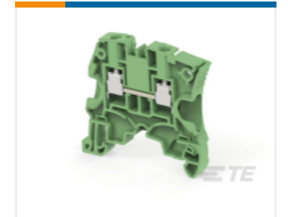
TE Part # 1SNK506061R0000 ZS6-GN