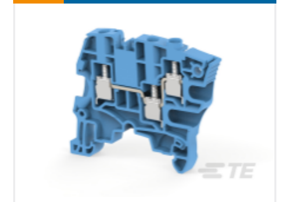
TE Part # 1SNK506021R0000 ZS6-3S-BL