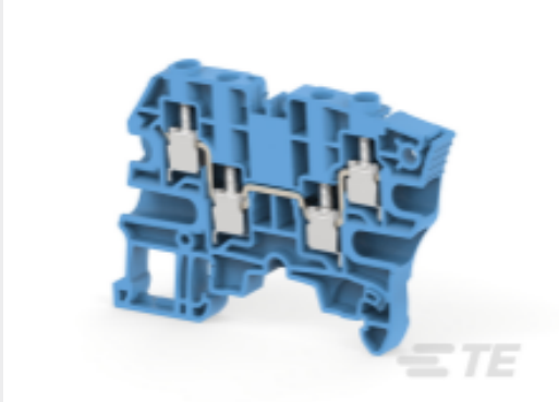
TE Part # 1SNK506022R0000 ZS6-4S-BL