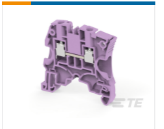
TE Part # 1SNK506063R0000 ZS6-PR