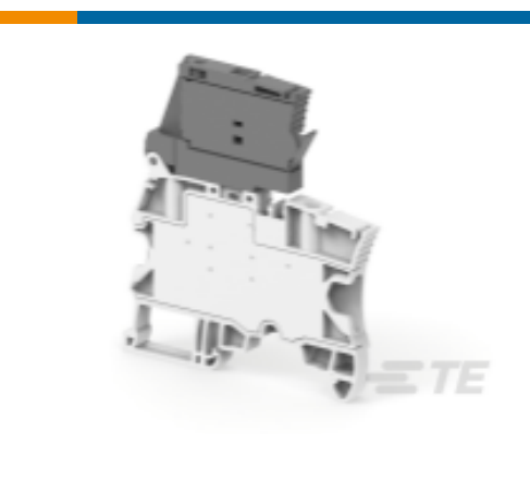
TE Part # 1SNK506410R0000 ZS4-SF