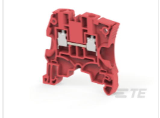
TE Part # 1SNK506062R0000 ZS6-RD