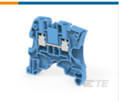
TE Part # 1SNK506020R0000 ZS6-BL