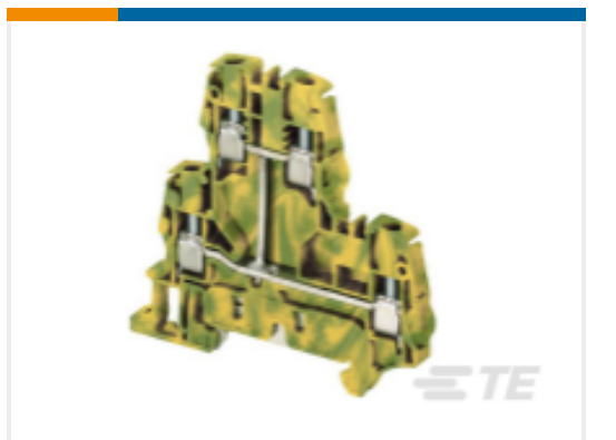
TE Part # 1SNK506250R0000 ZS6-D1-PE