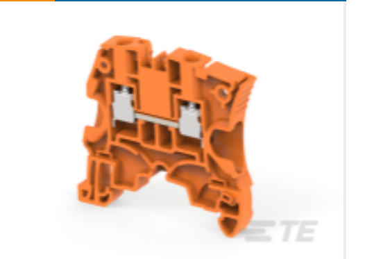
TE Part # 1SNK506030R0000 ZS6-OR