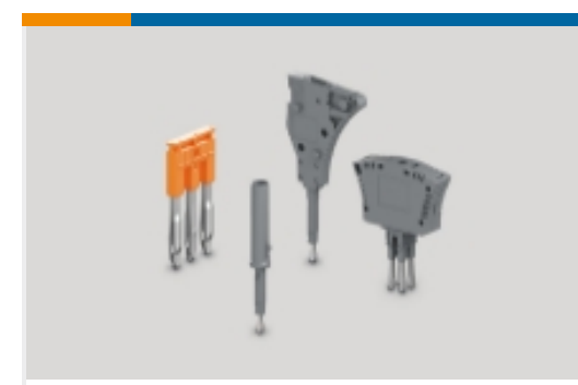
Terminal Block & Strip Conducting Accessories(67)