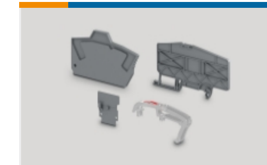
Terminal Block & Strip Insulating Accessories(31)