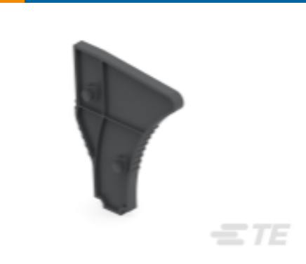
TE Part # 1SNK900104R0000 ES-TC8