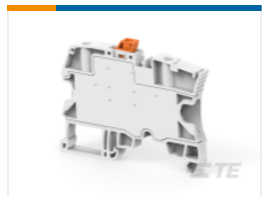
TE Part # 1SNK506310R0000 ZS4-S-R1