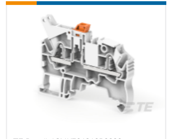
TE Part # 1SNK706310R0000 ZK2.5-S-R1