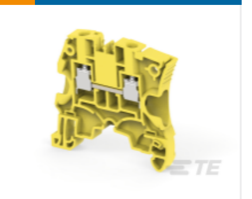
TE Part # 1SNK506060R0000 ZS6-YL