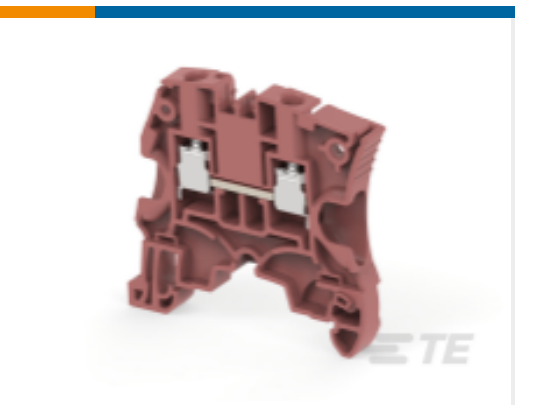
TE Part # 1SNK506064R0000 ZS6-BR