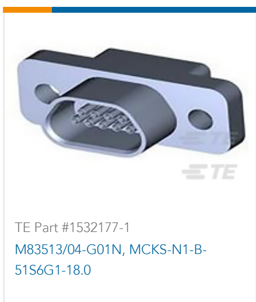
TE Part #1532177-1 M83513/04-G01N, MCKS-N1-B-51S6G1-18.0