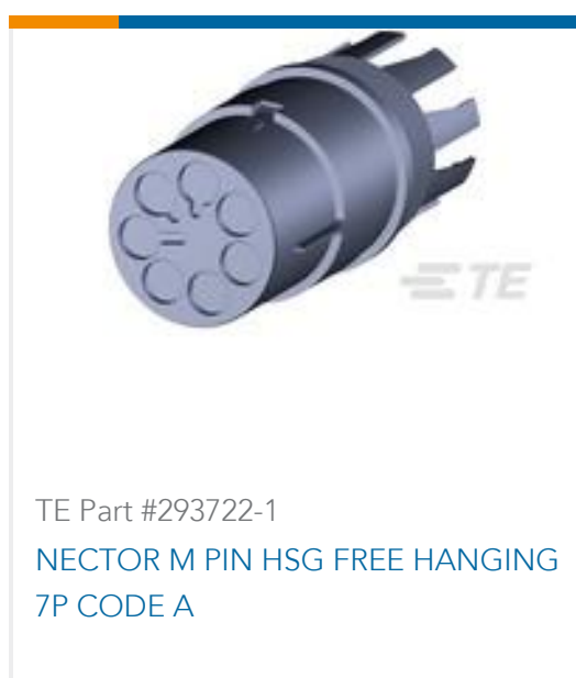
TE Part #293722-1 NECTOR M PIN HSG FREE HANGING 7P CODE A