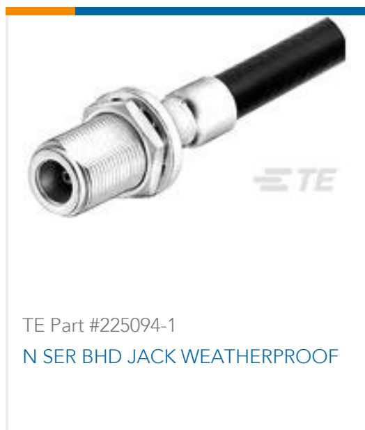
TE Part #225094-1 N SER BHD JACK WEATHERPROOF