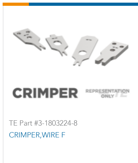
TE Part #3-1803224-8 CRIMPER, WIRE F