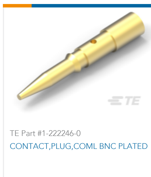
TE Part #1-222246-0 CONTACT, PLUG, COML BNC PLATED