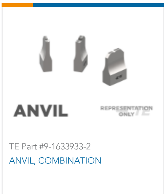
TE Part #9-1633933-2 ANVIL, COMBINATION