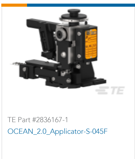
TE Part #2836167-1 OCEAN_2.0_Applicator-S-045F