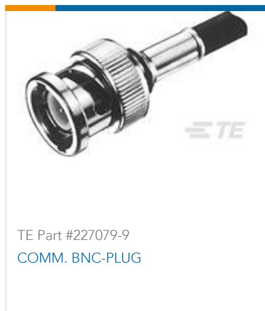
TE Part #227079-9 COMM. BNC-PLUG