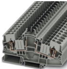
Component terminal block, with integrated P1000M diode, connection method: Spring-cage connection, cross section: 0.2 mm 2 - 10 mm 2 , AWG: 24 - 10, width: 8.2 mm, color: gray

Please be informed that the data shown in this PDF Document is generated from our Online Catalog. Please find the complete data in the user's documentation. Our General Terms of Use for Downloads are valid ( http://phoenixcontact.com/download )